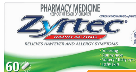
Zyrtec 60 Tablets

Always read the label. Follow the directions for use. If symptoms persist, talk to your health professional. Incorrect use could be harmful.