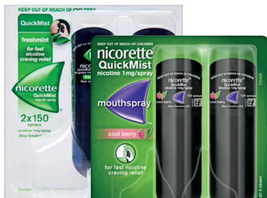
Nicorette QuickMist Freshmint Original or Cool Berry Duo