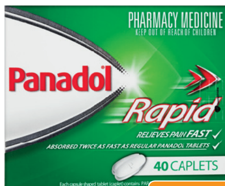
Panadol Rapid 40 Caplets

Always read the label. Follow the directions for use.